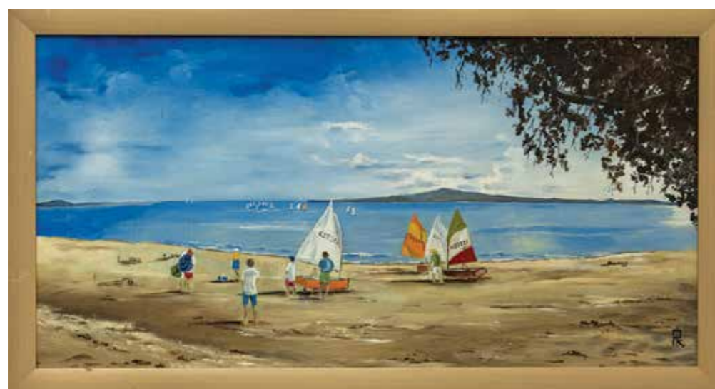
KERRY SWITZER Kohimaramara Yachts, Auckland 440 x 820mm, framed oil $1,300