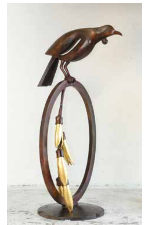
PAUL DIBBLE Bouquet of Bird and Flowers large , 2019 AP from an edition of 3 plus 1 artist's proof cast bronze and 24 carat gold gilding 2200 x 1100 x 1200mm $245,000