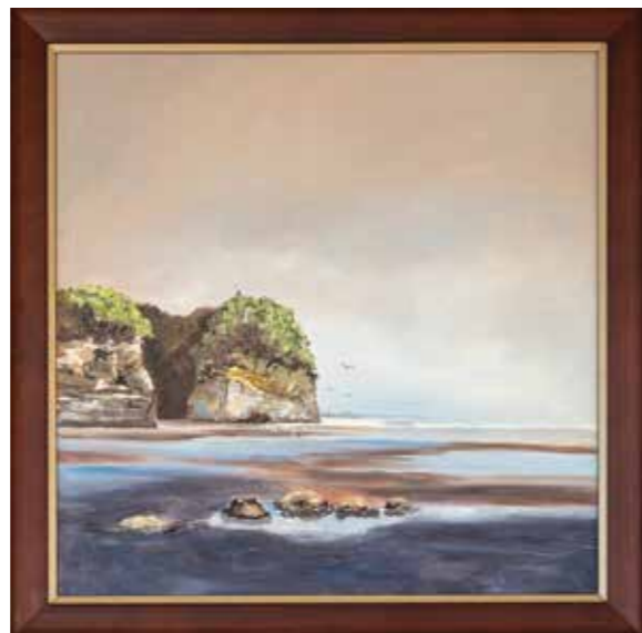
KERRY SWITZER Northern Taranaki Beachlands, NZ 730 x 730mm, framed oil $1,500