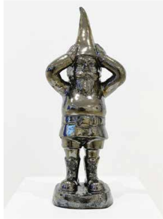
GREGOR KREGAR Oh No Thinker Gnome, 2021

cast iron 1200 x 430 x 350mm Edition of 3 $15,000