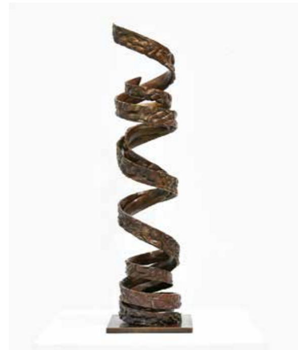
HANNAH VALENTINE She taught us to hold our connection, 2025

clay, lustre and resin 310 x 240 x 240mm $6,250