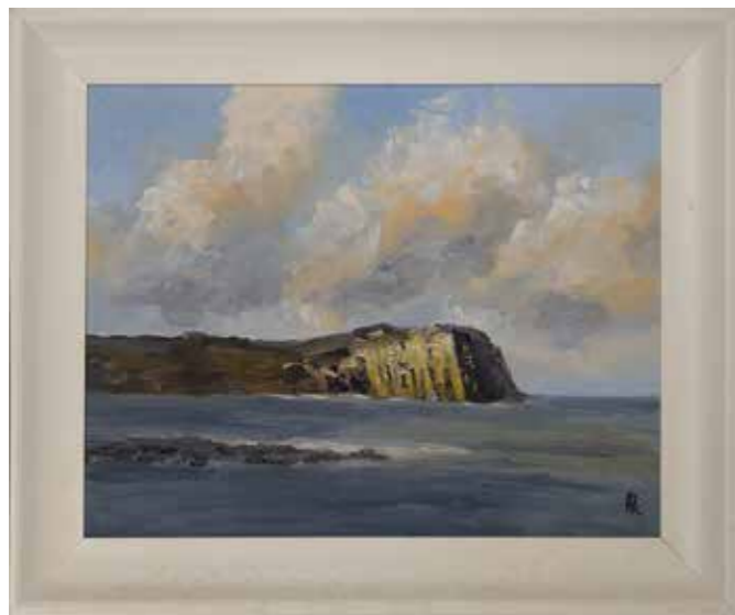
KERRY SWITZER Hauraki Gulf Seascape 520 x 630mm, framed oil $1,200