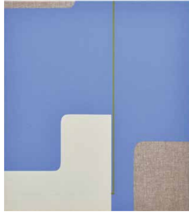
MATTHEW BROWNE Morii 24 , 2021 vinyl tempera and oil on linen 455 x 405mm $4,500