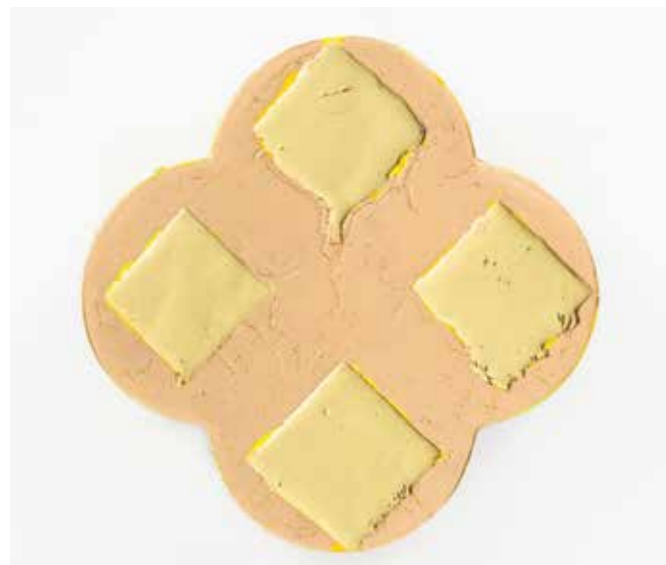
MAX GIMBLETT Diamond Kingdom, 2021-22

gesso, acrylic, water-based size, and French Pale 22kt gold and red gold leaves on muslin 381 x 381 x 51mm