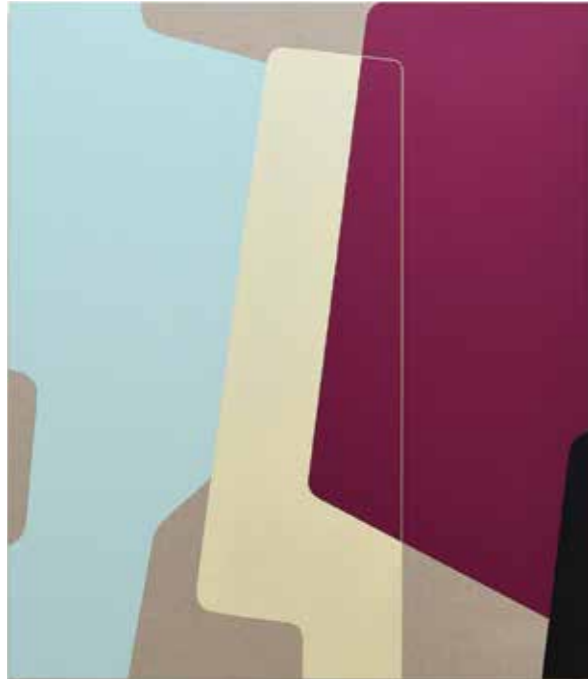
MATTHEW BROWNE Dion , 2023 vinyl tempera and oil on linen 1400 x 1200mm $12,500