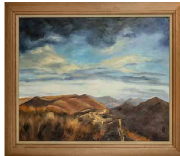
KERRY SWITZER Lindis Pass 630 x 740mm, framed oil $1,400