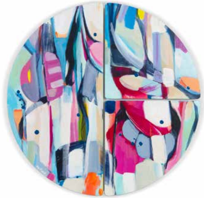
KIRSTY BLACK Damselfly Shimmy 2025 590 x 590mm, acrylic on ply $1,600