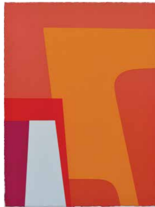
MATTHEW BROWNE Montage of Attractions 46 , 2024 acrylic on Fabriano Artistico 640gsm 255 x 190mm 305 x 235 x 30mm framed $1,450 framed