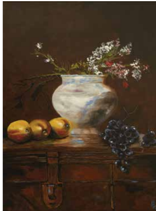
KERRY SWITZER Vase and Three Peaches 610 x 460mm, unframed acrylic $1,300