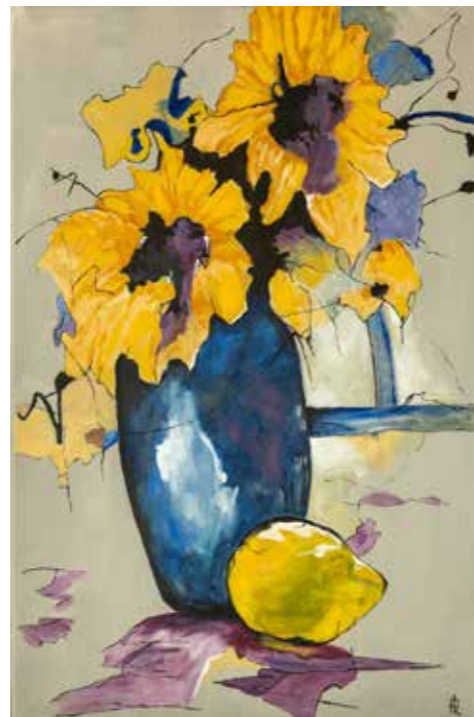
KERRY SWITZER Abstract Sunflowers and Lemon 760 x 760 mm, unframed acrylic $1,200