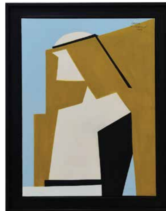
DAME LOUISE HENDERSON Arab Portrait No.8, 1959

oil on canvas 860 x 630mm 1005 x 780 x 60mm framed