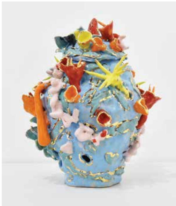
VIRGINIA LEONARD Urn for unwanted limbs and other things, 2023

clay, lustre and resin 260 x 240 x 250mm $5,000