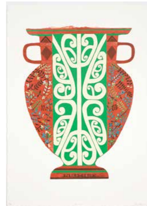
SHANE COTTON Ruahine , 2021 Edition of 40 plus 10 AP's screenprint on Lanaquarelle 640gsm paper 1050 x 760mm $11,000 framed