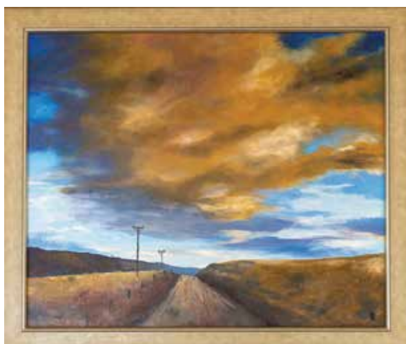
KERRY SWITZER Side Road on Rail Trail, Otago, NZ 640 x 740mm, framed oil $1,500