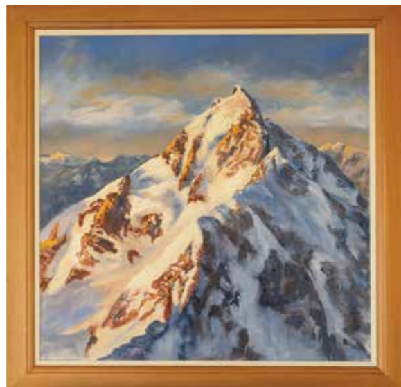
KERRY SWITZER Late Afternoon Sun Aoraki, Mt Cook 740 x 740mm, framed oil $1,500