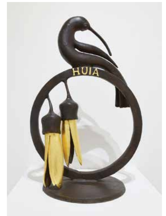
PAUL DIBBLE The Lost Garden model , 2023 AP from an edition of 10 cast bronze and 24 carat gold sheet 635 x 410 x 320mm $38,000