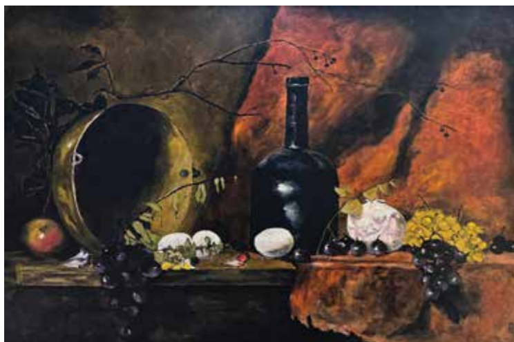
KERRY SWITZER Red Yellow & Blue Still Life 610 x 920mm, acrylic $1,300