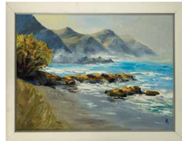
KERRY SWITZER Coastline North From Kaikoura 530 x 690mm, framed oil $1,200