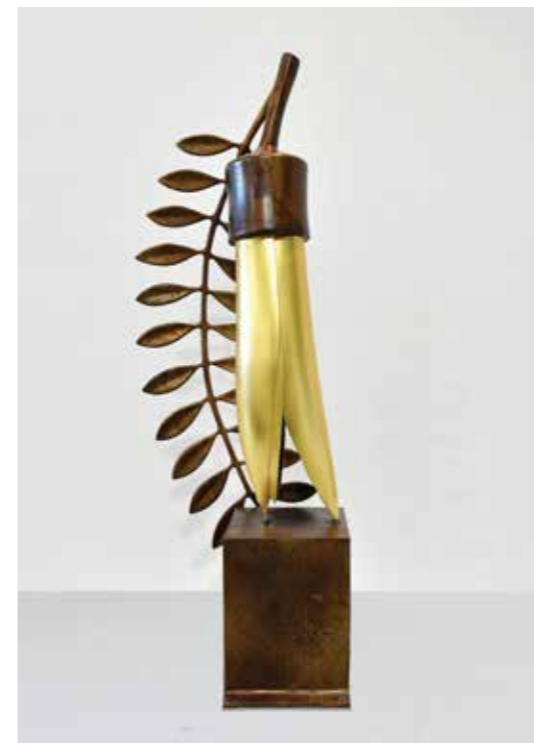
ESTATE OF PAUL DIBBLE Standing Kowhai , 2023 (cast 2024) Edition 4 of 10 plus 1 artist's proof bronze and 24 carat gold 1750 x 330 x 380mm $125,000