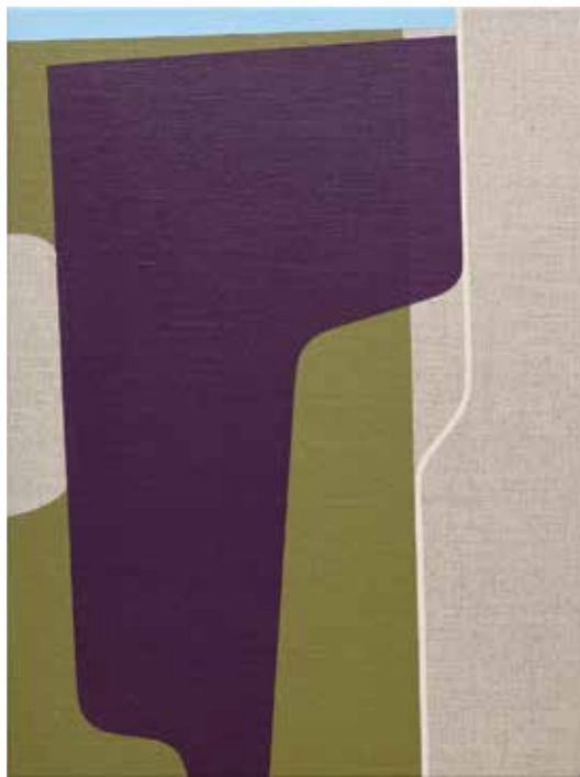
MATTHEW BROWNE Opia 3 , 2023 vinyl tempera and oil on linen 405 x 305mm $3,500