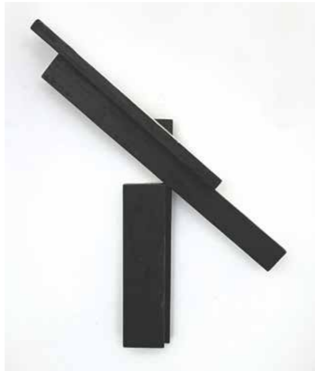
ALBERTO GARCIA-ALVAREZ 2000-3 mixed media on wood 2000 500 x 420mm $7,500 Kindly donated by Toss Grumley

“From 80,000 today to 170,000 by 2050 – dementia is one of New Zealand’s fastest-growing health challenges.”