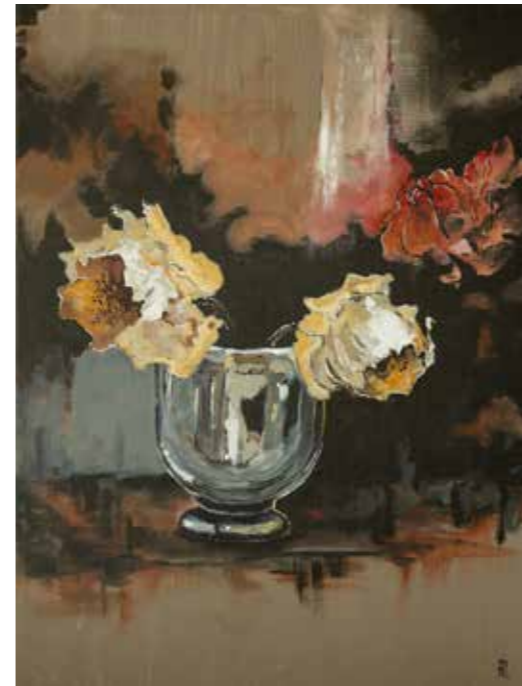
KERRY SWITZER Still Life with Wilting Blooms 610 x 460mm, unframed, acrylic $700