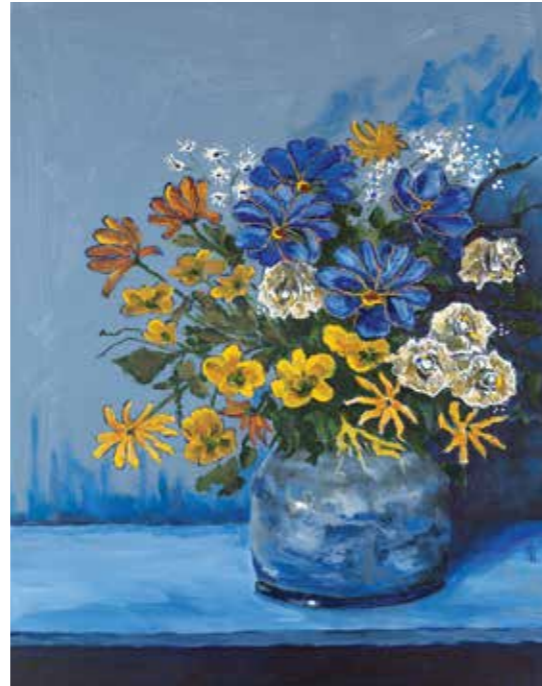
KERRY SWITZER Still Life in Blue 610 x 460mm, unframed acrylic $1,400