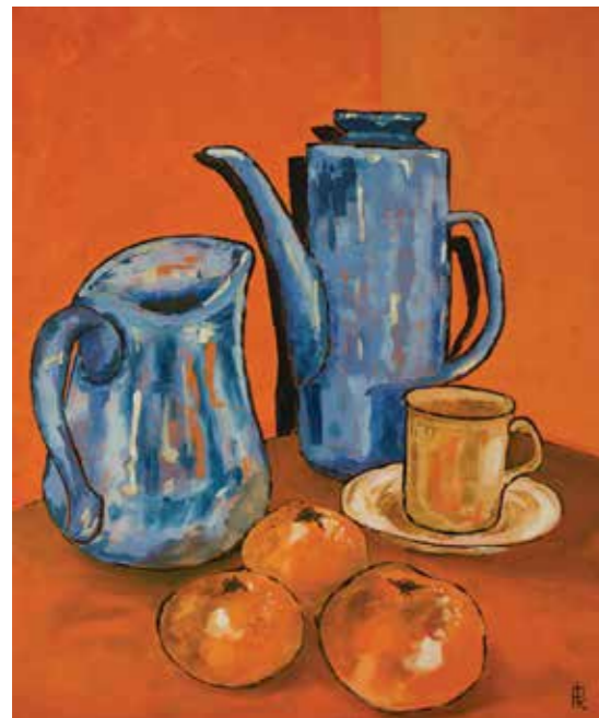
KERRY SWITZER Blues & Oranges 610 x 510mm, unframed acrylic $1,200