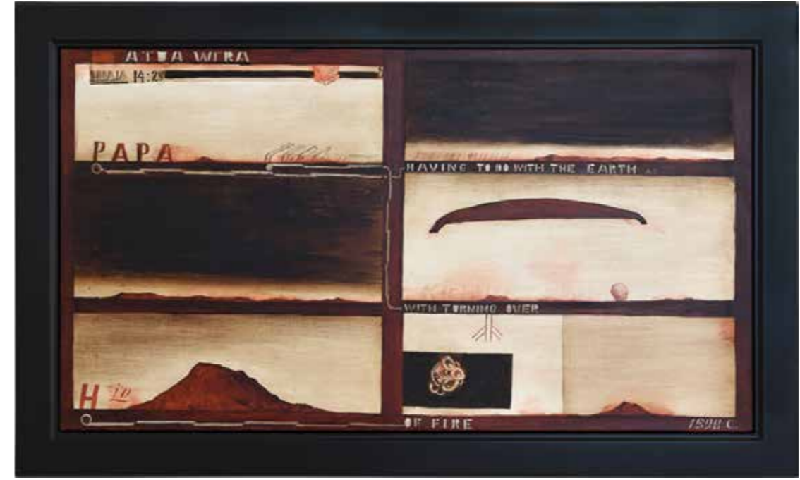
SHANE COTTON Whisper , 1998 synthetic polymer paint on canvas 560 x 1010mm 710 x 1160 x 55mm framed $95,000