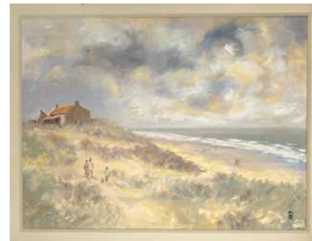
KERRY SWITZER East Coast England 520 x 660mm, framed oil $1,300