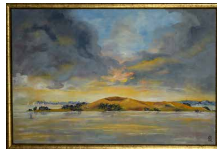
KERRY SWITZER Sunparched, Brown's Island, Auckland, NZ 560 x 810mm, framed oil $1,300