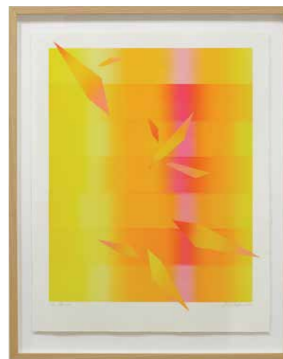
SARA HUGHES 421 Lux, 2025

Unique from a series of 10 hand rolled gradient, monotype elements, Chine-Colle on 290gm Fabriano paper 720 x 560mm 840 x 670 x 37mm framed