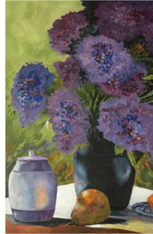
KERRY SWITZER Hydrangeas and Pear 910 x 610mm, unframed acrylic $1,200