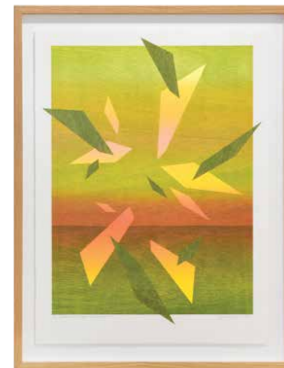
SARA HUGHES Scattering of Light-Whangapoua 2, 2025

Unique from a series of 5 hand rolled gradient, woodblock print with chine-colle on 290gm Fabriano Tiepolo 760 x 560mm 875 x 670 x 40mm framed