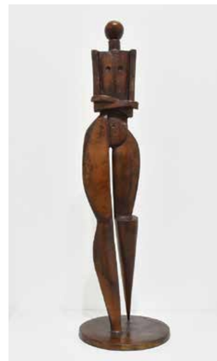
ESTATE OF PAUL DIBBLE Waiting for Time to Pass model , 2023 (cast 2025) Edition 7 of 10 plus 1 artist's proof cast bronze 690 x 190 x 190mm $18,000