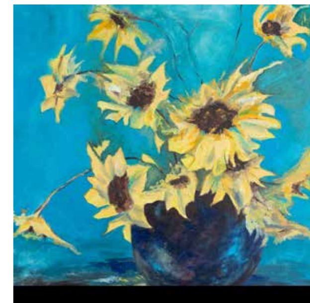
KERRY SWITZER Jazzy Sunflowers 610 x 610mm, unframed, acrylic $1,000