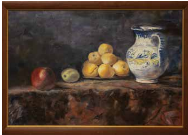
KERRY SWITZER Antique Jug & Fruit 560 x 810mm, framed oil $1,300