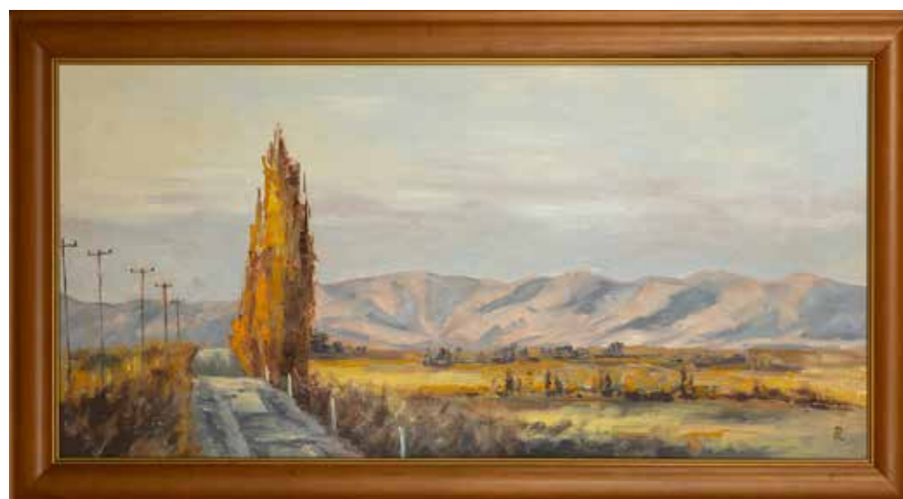
KERRY SWITZER Road to St Bathans 460 x 840mm, framed oil $1,200