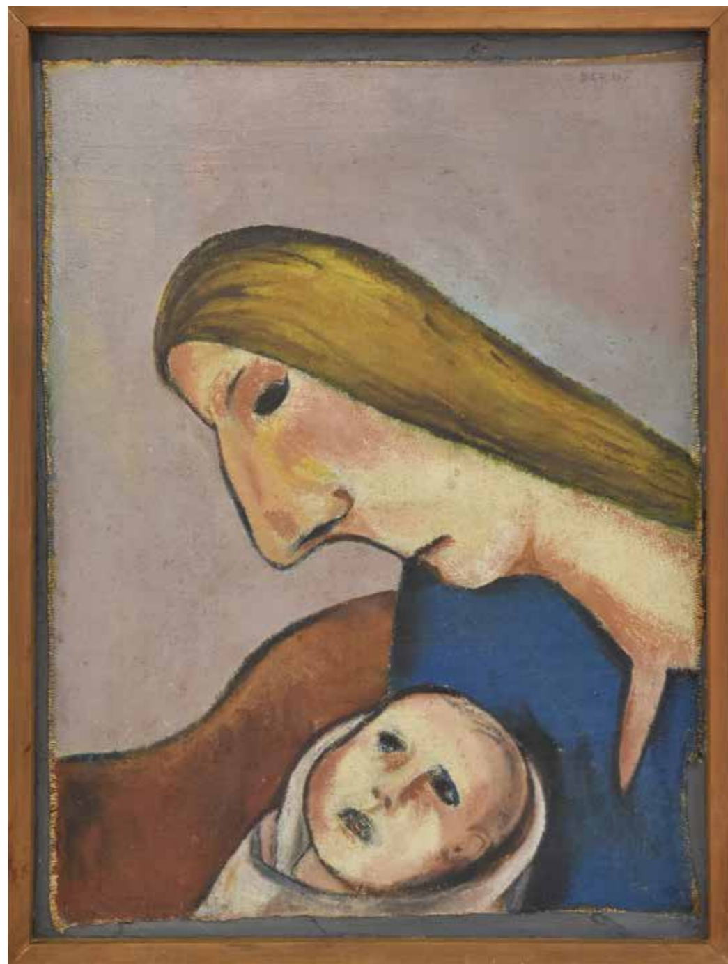
COLIN MCCAHERN Mother and child , 1947 oil on jute canvas on board 804 x 620mm 895 x 675 x 30mm framed P.O.A