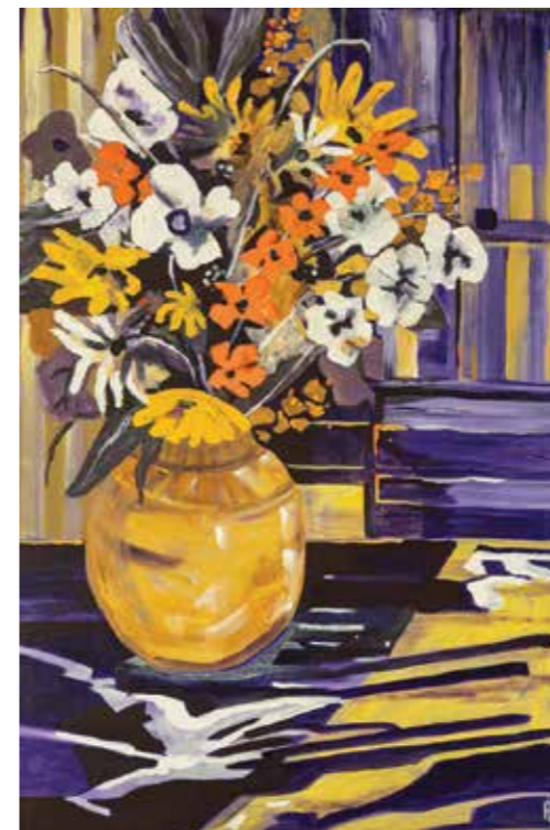
KERRY SWITZER Mod Florals 760 x 510mm, unframed acrylic $1,300