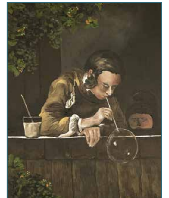
KERRY SWITZER Bubble Blower (Jean Baptiste Chardin) 610 x 460mm, unframed acrylic $1,000