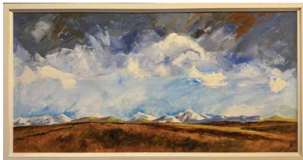
KERRY SWITZER Big Sky MacKenzie Basin 560 x 1060mm, framed oil $1,750