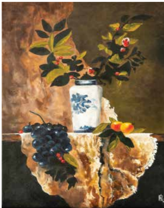
KERRY SWITZER Still Life with Grapes 610 x 450mm, unframed acrylic $1,200