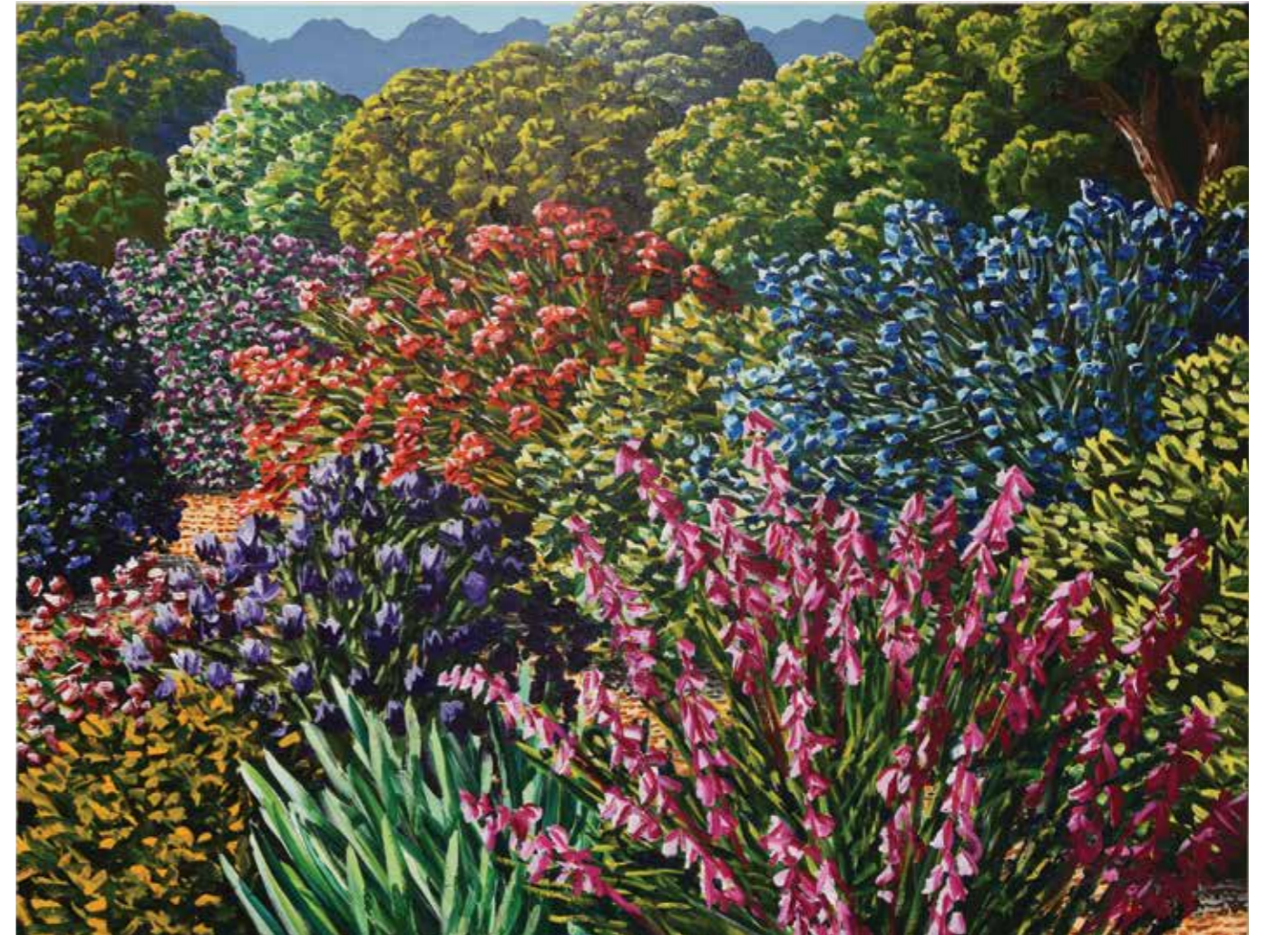
KARL MAUGHAN Winiata, 2023

glazed ceramic, metallic 550 x 230 x 155mm open edition $2,200