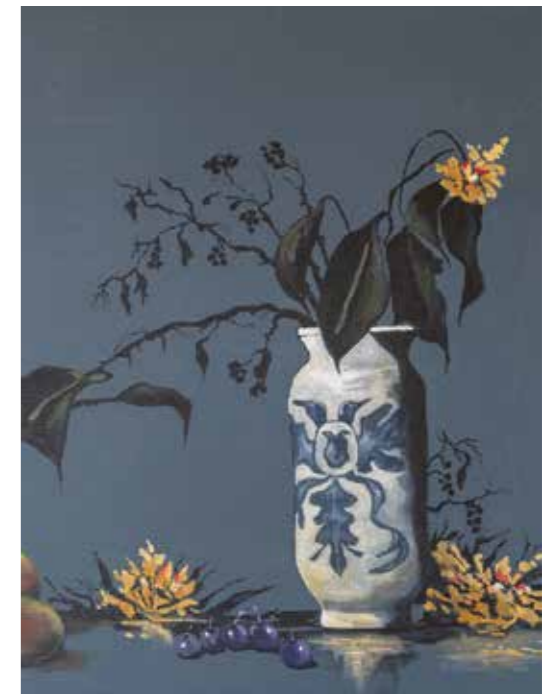
KERRY SWITZER Blue and White Vase 610 x 460mm, unframed acrylic $1,200