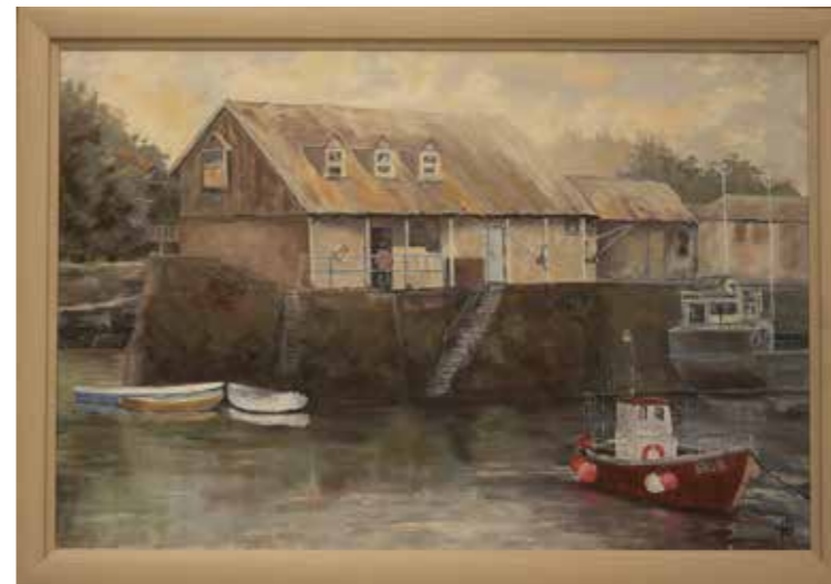
KERRY SWITZER Cornish Fishing Village 580 x 830mm, framed oil $1,500