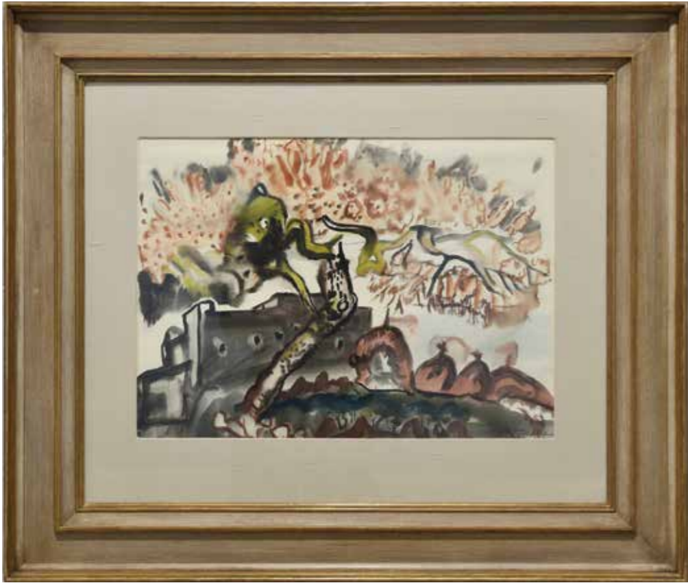
FRANCES HODGKINS Almond Tree, 1933 gouache on paper 393 x 539mm 740 x 870 x 40mm framed $185,000

This collaboration has shown the power of art, generosity, and community coming together, and we look forward to seeing these works find homes where they will be treasured.