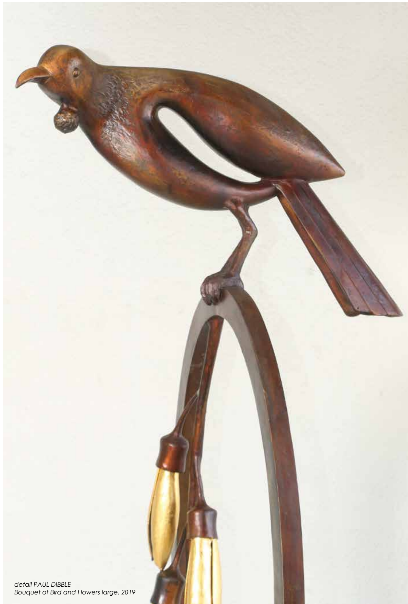
detail PAUL DIBBLE Bouquet of Bird and Flowers large, 2019