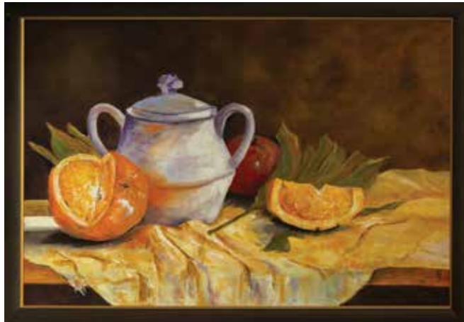
KERRY SWITZER Mainly Orange 660 x 970mm, framed oil $1,500