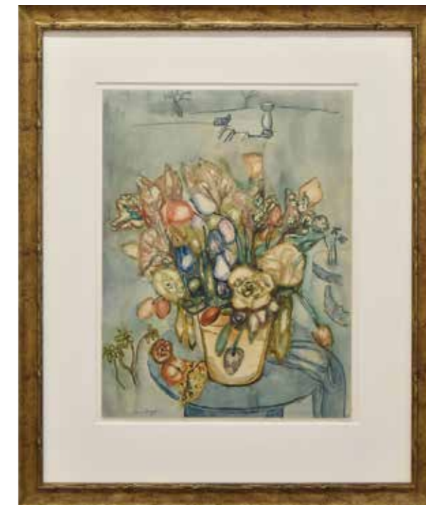
FRANCES HODGKINS Flowers in a Bowl, c.1930