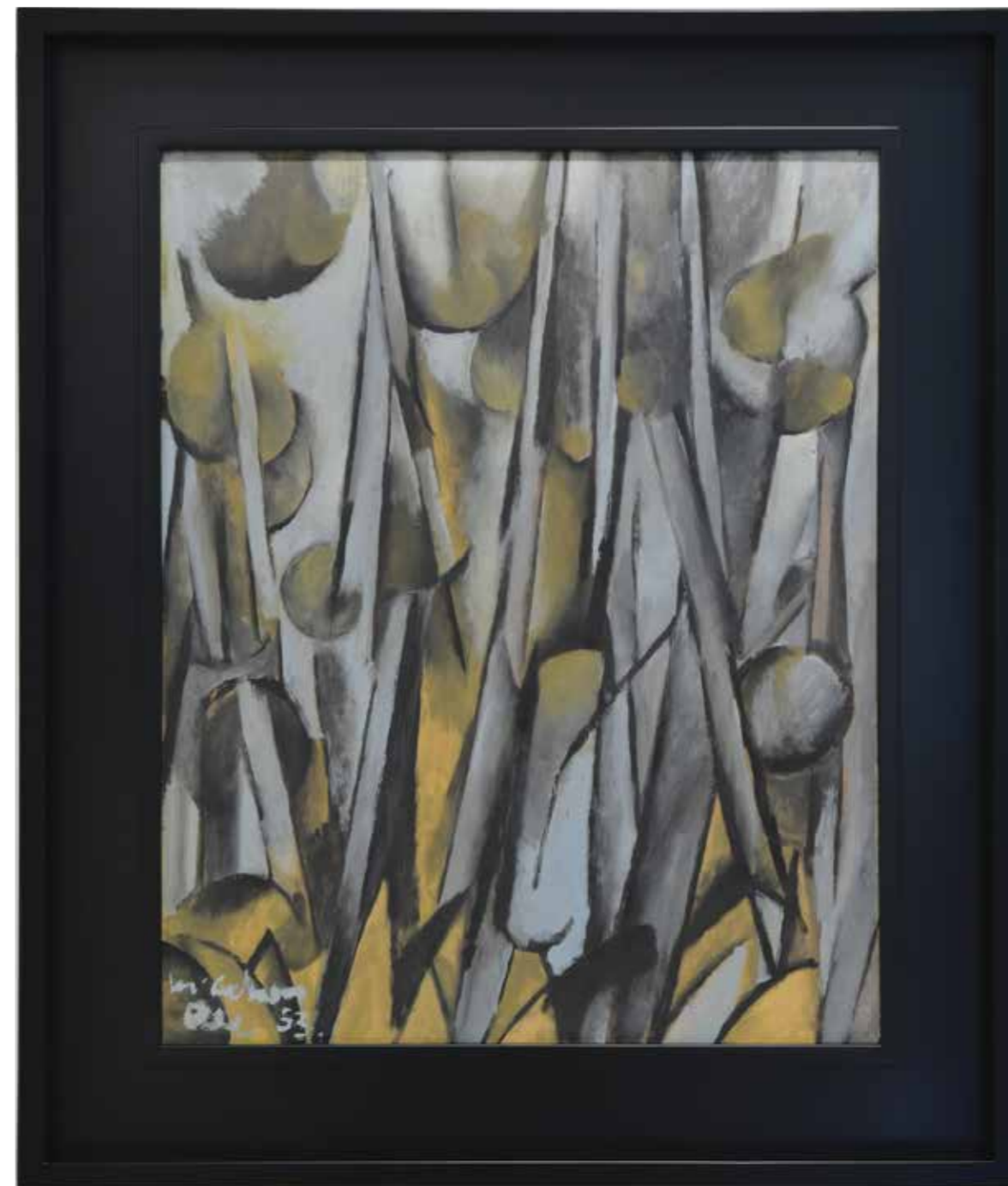
COLIN MCCAHERN Kauri , 1953 oil on cardboard 637 x 510mm 825 x 700 x 55mm framed P.O.A