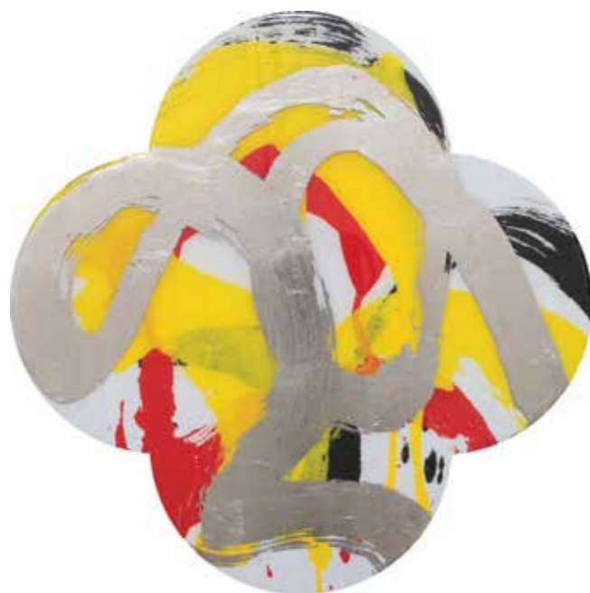
MAX GIMBLETT Throne, 2014

gesso, acrylic and vinyl polymers, resin, water based size, aluminium leaf on canvas 381 x 381 x 51mm