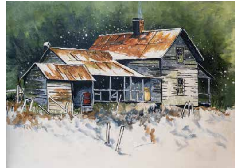
KERRY SWITZER Old Farmhouse in Snow 460 x 610mm, unframed acrylic $1,200