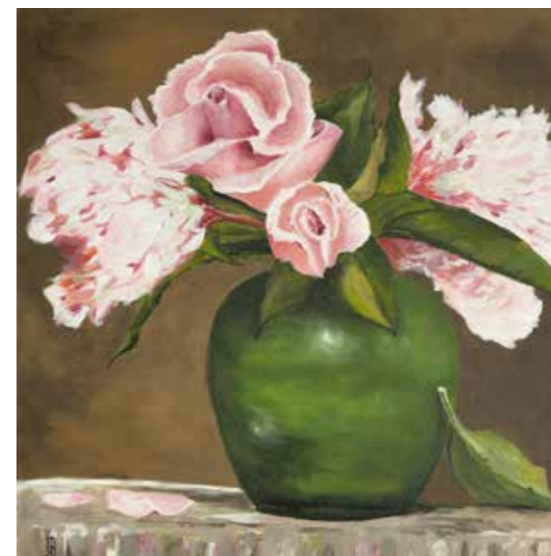
KERRY SWITZER Pink Peonies & Roses 610 x 610mm, unframed acrylic $1,000