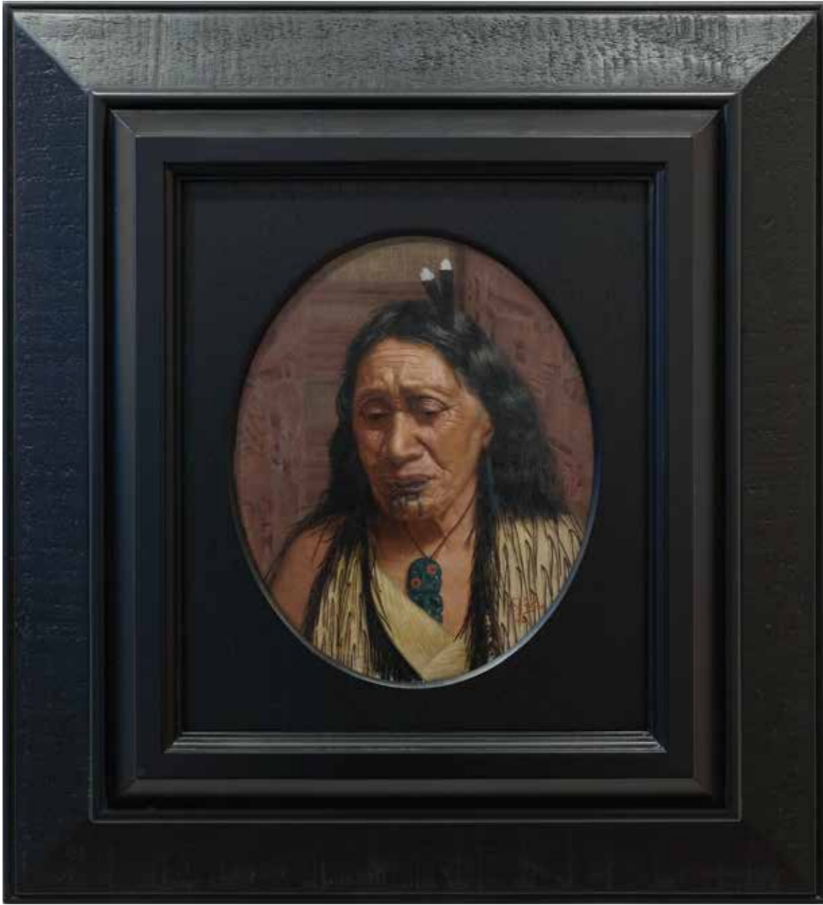
CHARLES FREDERICK GOLDIE The Widow: Perira te Kahukura (Ngāheke), 1914 oil on canvas 255 x 205mm 515 x 465 x 60mm framed P.O.A