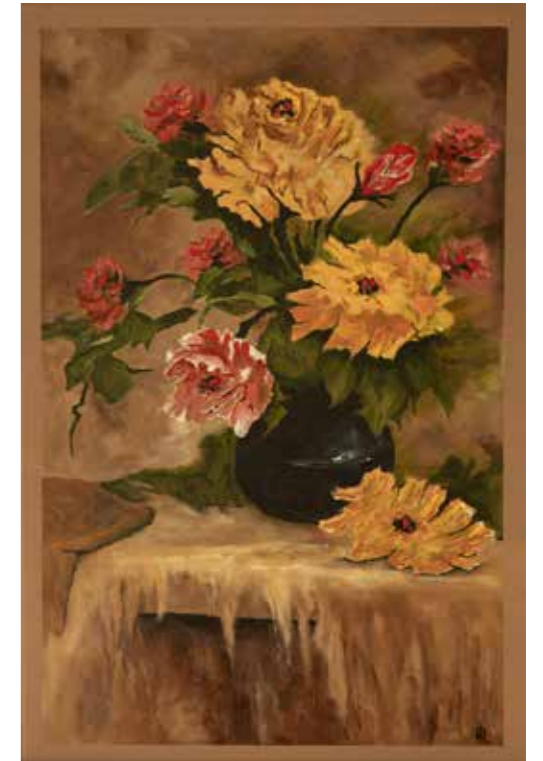
KERRY SWITZER Floral Splendour 760 x 510mm, unframed, acrylic $1,200