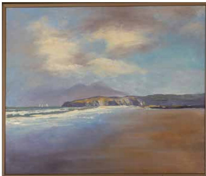
KERRY SWITZER Raglan at Low Tide 580 x 680mm, framed oil $1,300