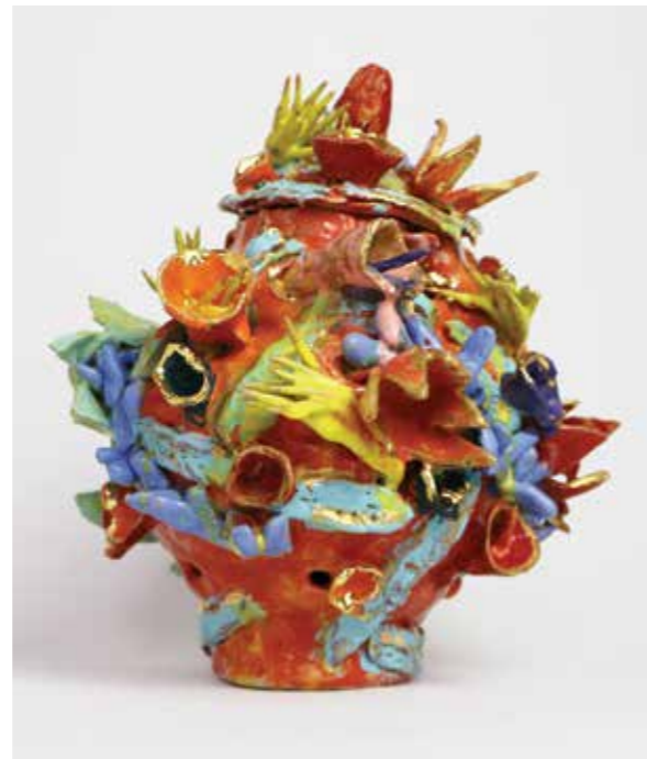
VIRGINIA LEONARD Urn 3, 2024

clay, lustre and resin 260 x 240 x 250mm $5,000