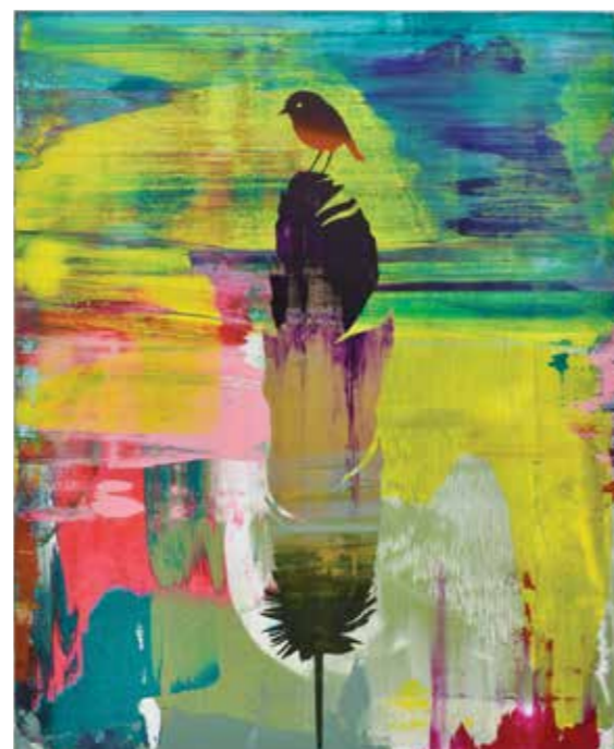
CHRIS HEAPHY This is How We'll Rest till Land Turns to Sand, 2024

acrylic on Belgian linen 1620 x 1300 x 35mm