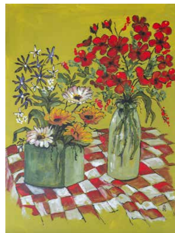
KERRY SWITZER Checked Cloth & Flowers 610 x 460mm, unframed, acrylic $800