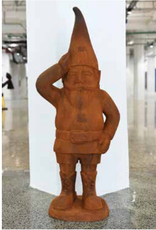
GREGOR KREGAR Corten Thinker Gnome, 2022

cast iron 1200 x 430 x 350mm Edition of 3 $15,000