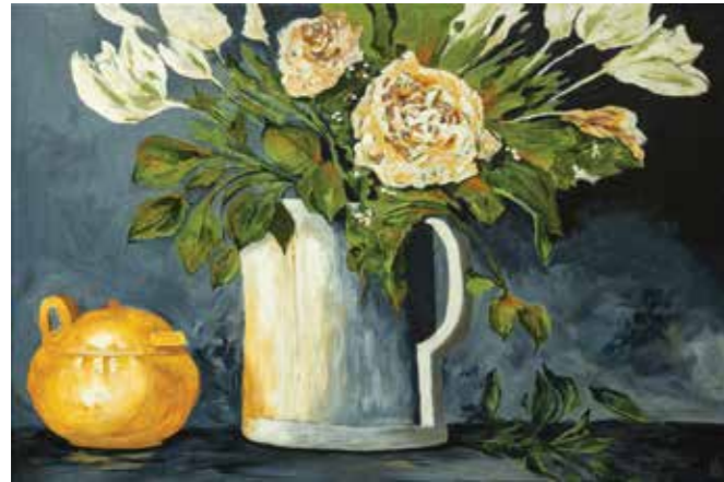
KERRY SWITZER Peonies and Gold Jar 510 x 760mm, framed acrylic $1,800

100% of proceeds from every piece will go to: Dementia Auckland's vital programmes and services for people living with dementia, and their families.