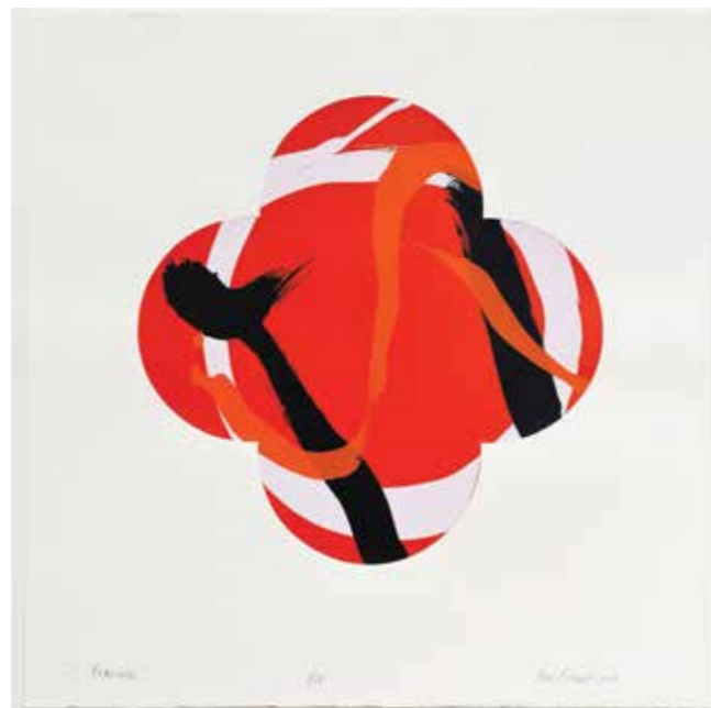
MAX GIMBLETT Flamingo, 2021

Edition of 10 plus 3 artist's proofs screenprint on Fabriano 50% cotton paper 560 x 560mm